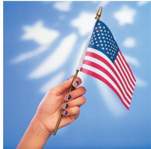
Fourth of July